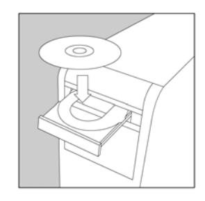
Insert the CD into your PC and follow the on-screen instructions. Note you must choose the Driver Only installation in order for your webcam to function properly. You will be prompted to restart your PC.

Note in order for you to use your webcam you must install the software before plugging the webcam into your PC.